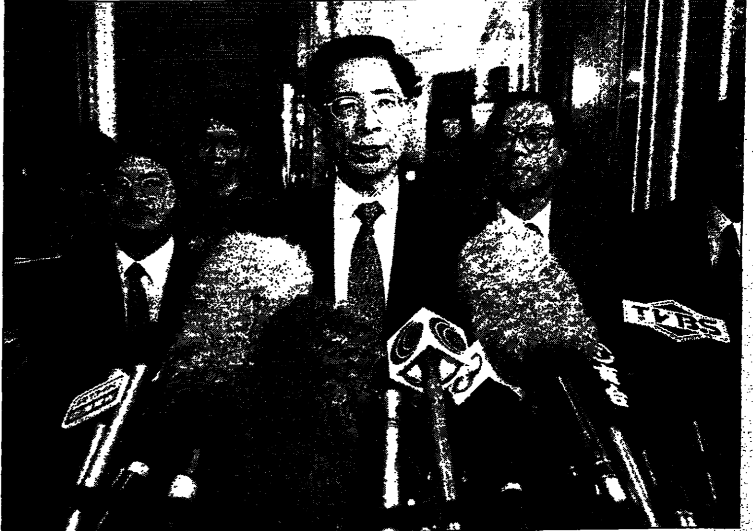
Democratic Party leader Martin Lee speaks to reporters after meeting with Hong Kong leader Tung Chee-hwa yesterday.

China plans to disband Hong Kong's elected legislature and replace it with a largely self-selecting provisional body, swearing it in